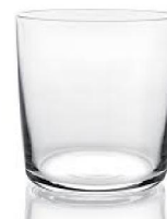
a. Glass A