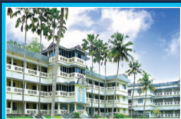
St. John The Baptist's College of Education Nedumkunnam