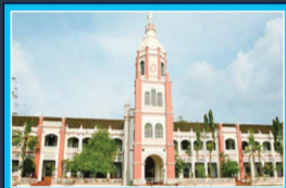
S B College Changanacherry (Autonomous)