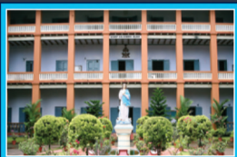
Assumption College Changanacherry (Autonomous)