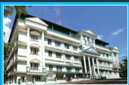
Media Village College of Communication Changanacherry