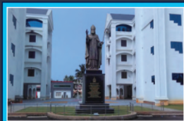
Mar Gregorios College Punnappra