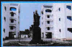
Mar Gregorios College Punnapra