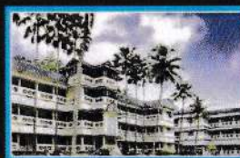
St. John The Baptist's College of Education Nedumkunnam