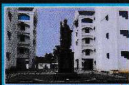
Mar Gregorious College Punnappa