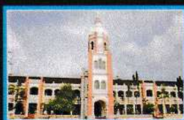
S B College Changanacherry (Autonomous)