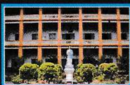
Assumption College Changanacherry (Autonomous)