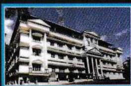
Media Village College of Communication Changanacherry